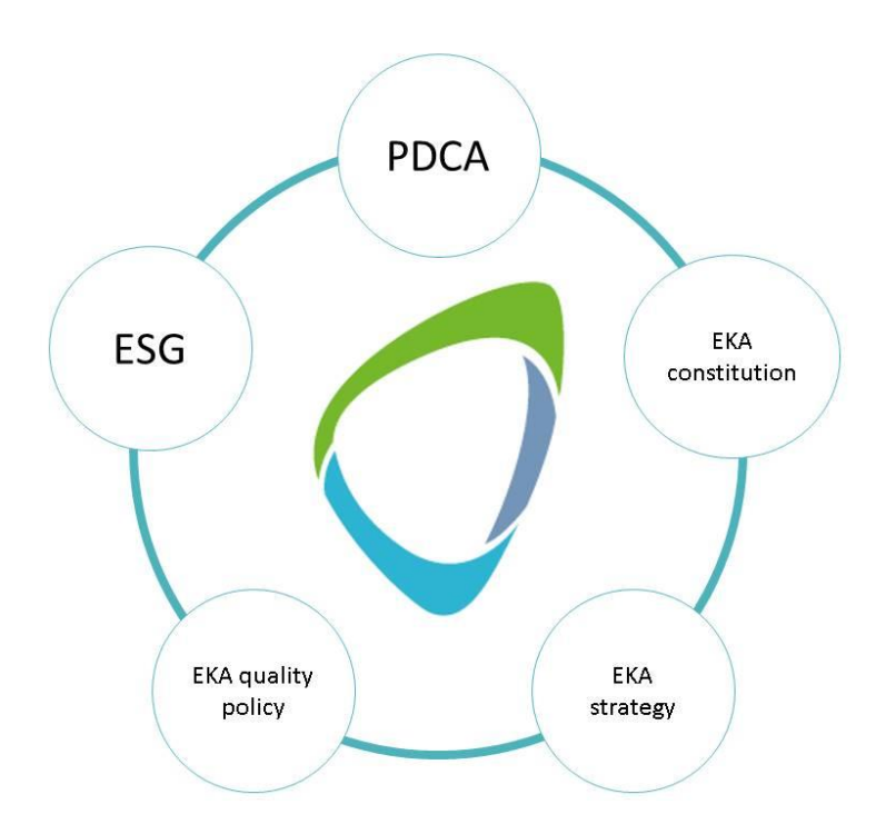
Figure 1. Integration of EKA's excellence approach.